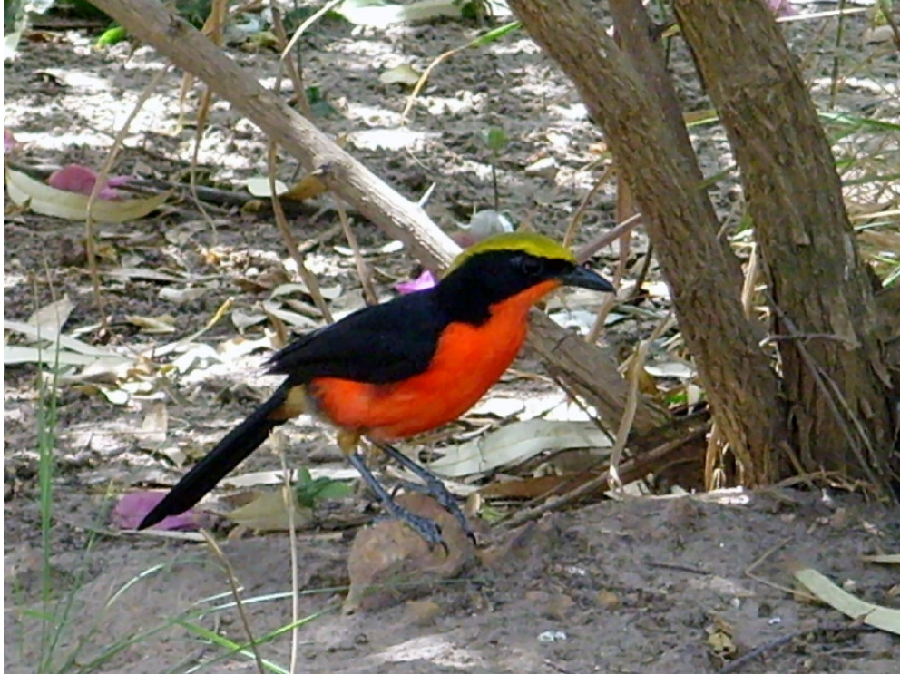
YELLOW CROWNED GONOLEK