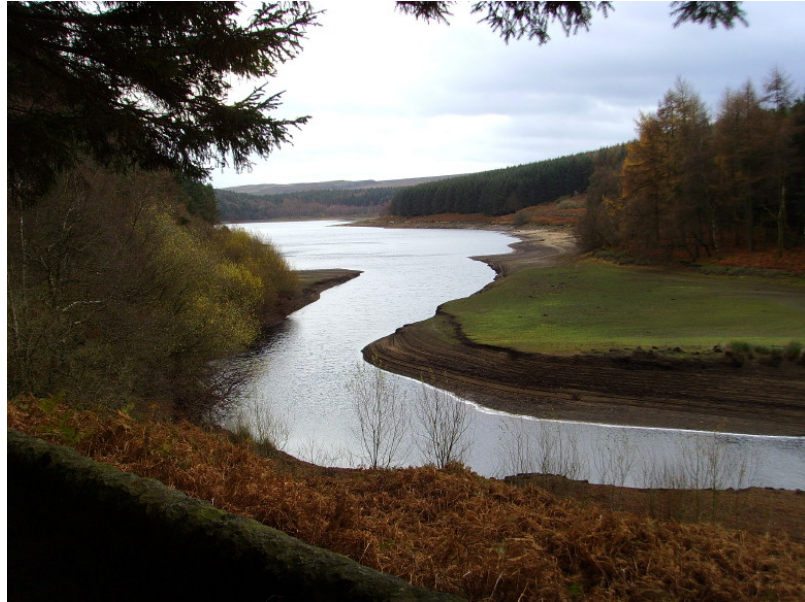
VIEW FROM INLET AREA AT LANGSETT RES

We saw a group of Crossbill and Siskin flying through. It wasn't till we got back near the car park that we started to pick up the birds. One tit flock came thru holding Blue, Coal and Long Tailed Tits . Kestrel was seen sitting on the field wall but soon took to flight when we got near the bird. A male Pheasant headed off in the opposite direction as soon as we rounded the corner of the field. Overhead Peregrine Falcon came and soon went. On approach to the car park Great Spotted Woodpecker was heard before being picked up high in a tree. On inspection of the bird it was seen clearly that this was a female bird.